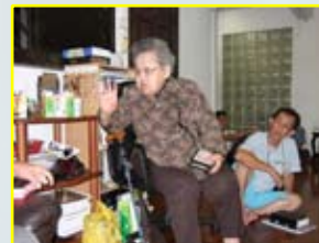
Place Your Pense in Christ