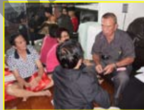
Sharing his Past